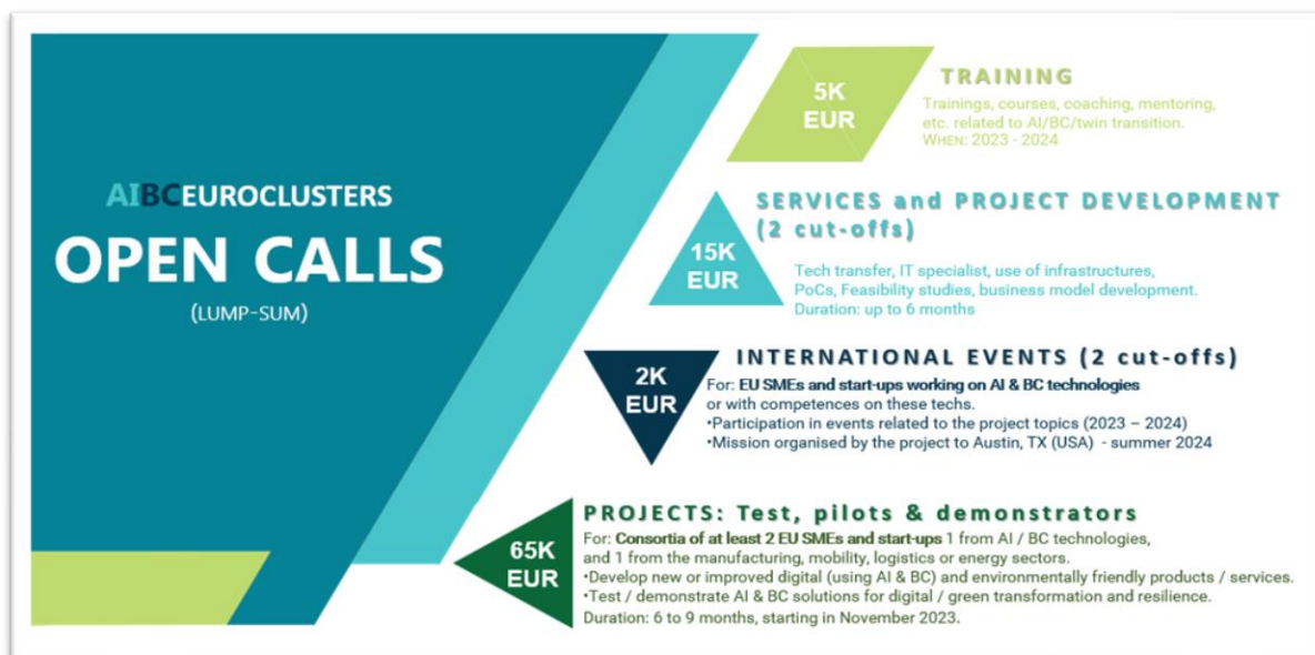
Figure 1. AIBC EUROCLUSTERS calls.

The AIBC EUROCLUSTERS support is targeted to European SMEs and start-ups working on the AI & BC technologies, from the manufacturing, mobility, logistics and energy industrial ecosystems, that are interested in adopting AI & BC solutions to be more digital, resilient and green. The project implements several Open Calls to select companies and projects and thus will provide Financial Support to Third Parties (FSTP) for the following activities: