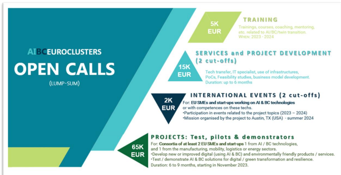
Figure 1. AIBC EUROCLUSTERS calls.

The AIBC EUROCLUSTERS support is targeted to European SMEs and start-ups working on the AI & BC technologies, from the manufacturing, mobility, logistics and energy industrial ecosystems, that are interested in adopting AI & BC solutions to be more digital, resilient and green. The project implements several Open Calls to select companies and projects and thus will provide Financial Support to Third Parties (FSTP) for the following activities: