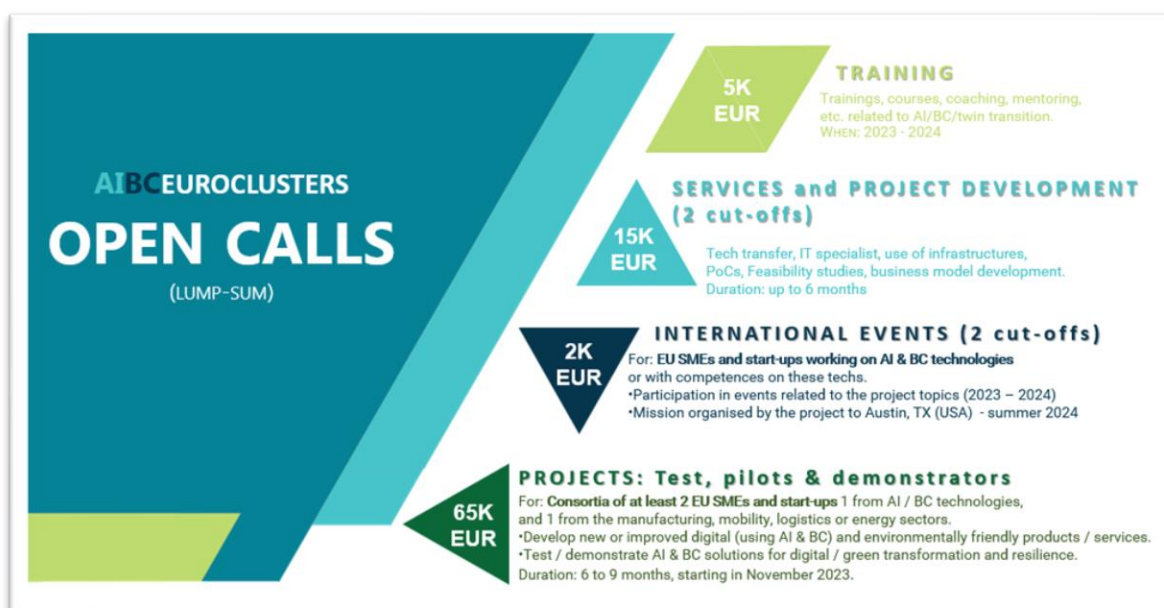
Figure 1. AIBC EUROCLUSTERS calls.

The AIBC EUROCLUSTERS support is targeted to European SMEs and start-ups working on the AI & BC technologies, from the manufacturing, mobility, logistics and energy industrial ecosystems, that are interested in adopting AI & BC solutions to be more digital, resilient and green. The project implements Open Calls to select companies and projects and thus will provide Financial Support to Third Parties (FSTP) for the following activities: